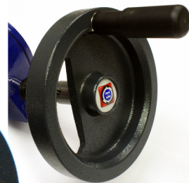
Handwheel, w/fold-down knob